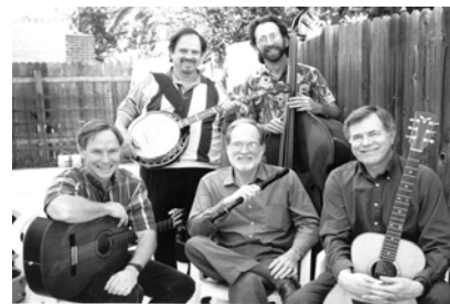
The Highwaymen Circ. 1960.