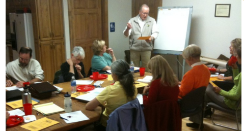
Strategic Planning Meeting Fall 2009

Come and celebrate another year with us and learn what YOUR Fox Cities Greenways organization is planning for 2010. Mark the date: Thursday, January 28 th , 2010. I hope to see you there.