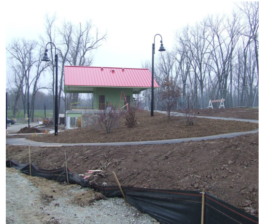
Fritse Comfort Station

A new trailside comfort station will open in April 2010 at Fritse Park along the Fox Cities Friendship/Trestle Trail. The comfort station will feature seasonal (April-November) bathroom facilities at the trail level with an overlook of the park and lake. The lower level will be open year-round and feature restrooms and a warm area. The comfort station is one part of a complete renovation of Fritse Park including a new quiet water launch, motor launch, parking facilities and an adventure play area. For more information, please contact the Town of Menasha – Park and Recreation Department at 920-720-7108.