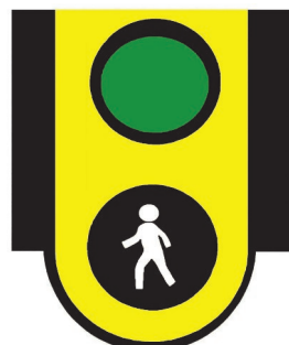
Appleton Safe Routes to School