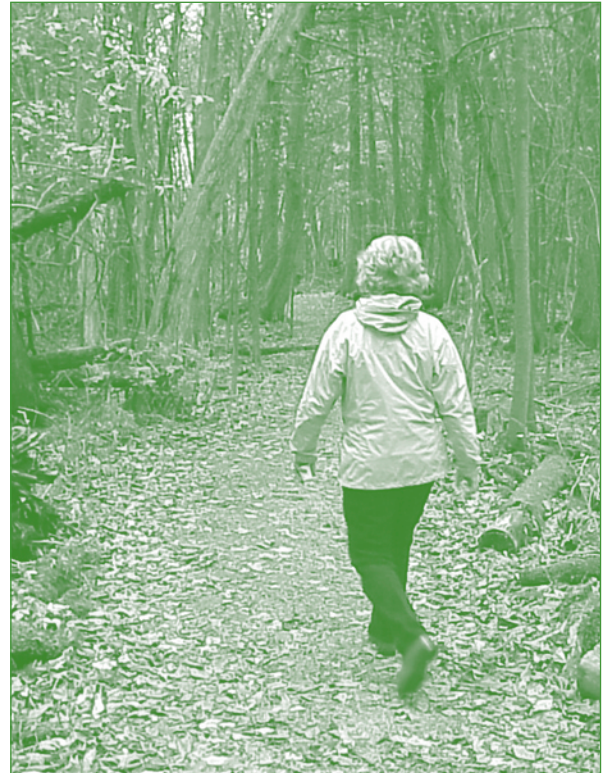
Hiking the trails at Bubolz.