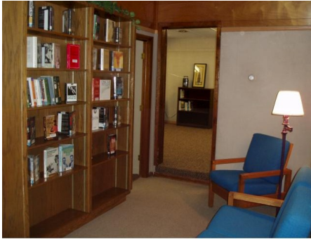
Library Reading Room