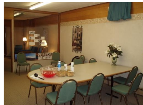
Main Meeting Area