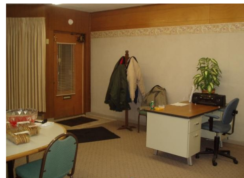
Reception Desk and Front Entrance