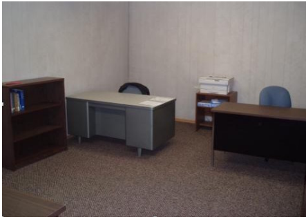
Office Area in Rear of Space